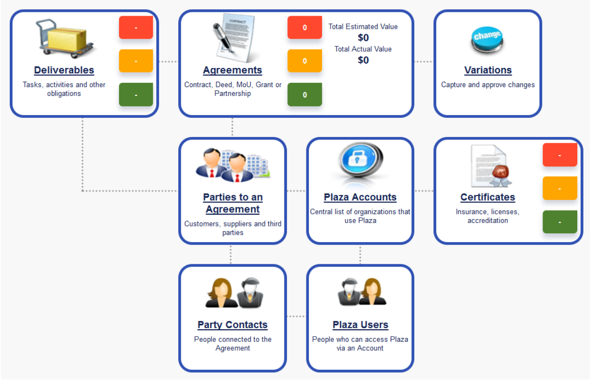
Figure 2 Plaza<sup>™</sup> Home Page