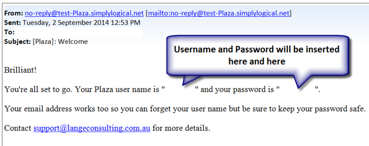
Figure 6 Example email of Plaza™ login details